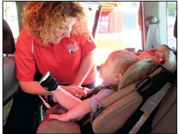
Colleen recommends the "Tickle Technique" to check for a good fit!